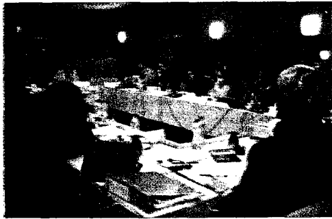
Coalition for Sexual and Bodily Rights in Muslim Societies has realized groundbreaking achievements in the Middle East, North Africa and South / Southeast Asia during the past six years